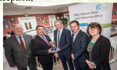
Presentation of National Enterprise Award to Kilkenny Winners Greensbridge Engineering Ltd