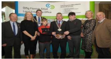
Presentation of Student Enterprise Awards to Intermediate Category Winners – TK ceramics, Coláiste Eamann Rís

from St. Brigid's College, Callan. The three category winners will now prepare for the National Finals which will be held on Wednesday 3 rd May in Croke Park.