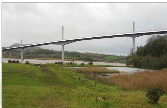
Photomontage elevation from Kilkenny side

The 'Pink Rock' Road (LS7512) on the Kilkenny side has also been closed since June and will remain so until June 2017 to facilitate access to the bridge site and also for the construction of a bridge pier. Further traffic management operations will proceed over the coming months, including on the N25 to facilitate the construction of the N25 Glenmore Roundabout.