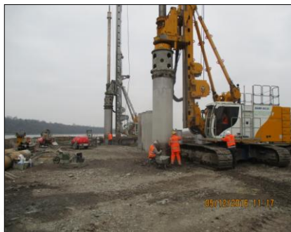
Barrow Bridge - Temporary working platform and piling operations at river pier (pier 4)