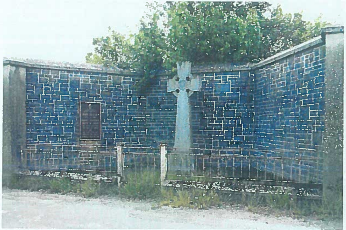
Monument in Burnchurch to John Ireland, 1 st Archbishop of St. Paul Minneosta