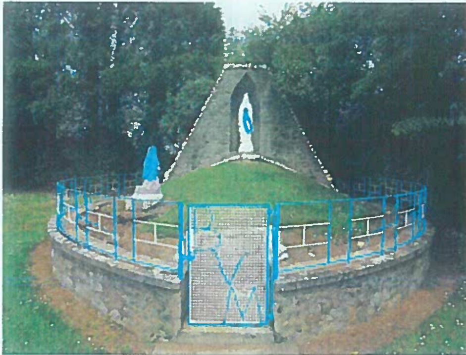
AMPS Ref 91121_01: Grotto outside Dunnamagan to 'Our Blessed Lady'.