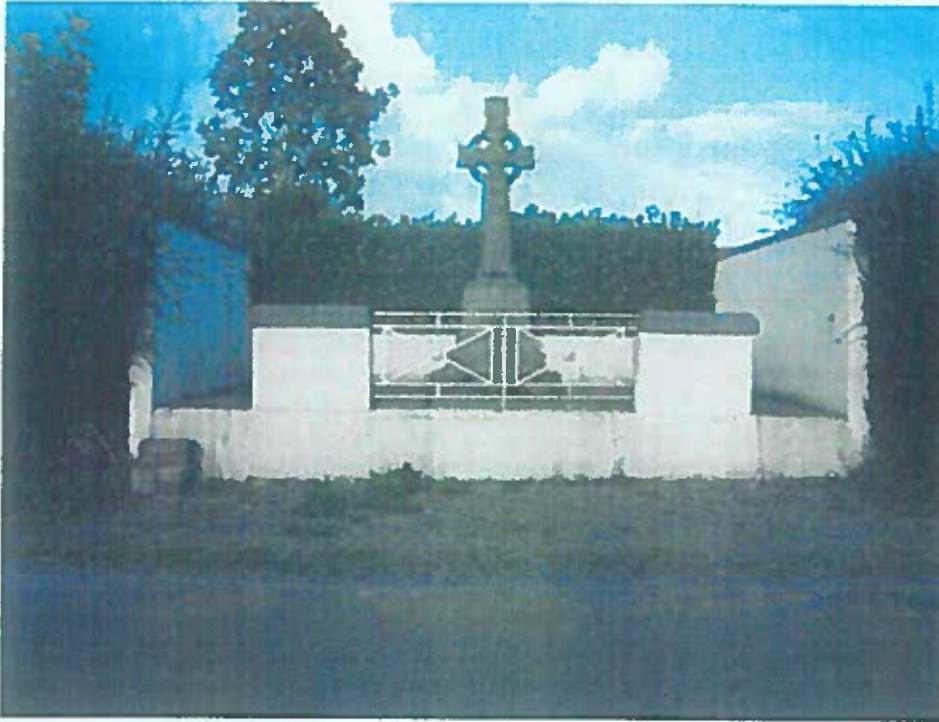
AMPS Ref 91229_01: Monument near Tullaroan commemorating the Battle of Knocknagrass.