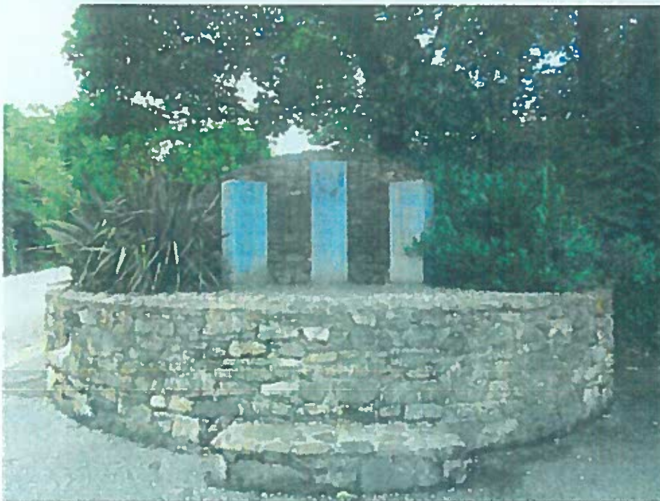
AMPS Ref 91394_02: Millennium monument at Glenmore listing townlands and number of inhabitants at the millennium